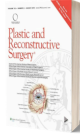
Plastic and Reconstructive Surgery June 2025