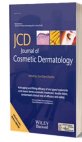
Journal of Cosmetic Dermatology June 2025