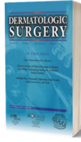
Dermatologic Surgery June 2025

As a CPCA member, you have access to 5 online clinical journals via the CPCA Members Area of the website at no additional cost. To access the journals, all you need to do is log into the CPCA Members Area via the CPCA website, find the Portal, and click on Journal Access! Remember that you can also gain CPD points by recording the hours you spend on reading these online clinical journals!